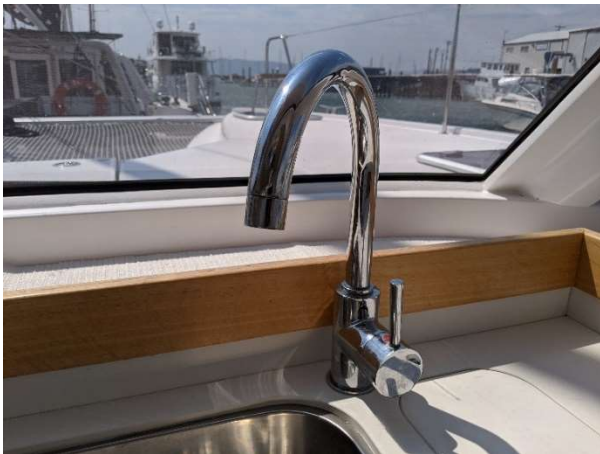
FRESH WATER GALLEY FAUCET