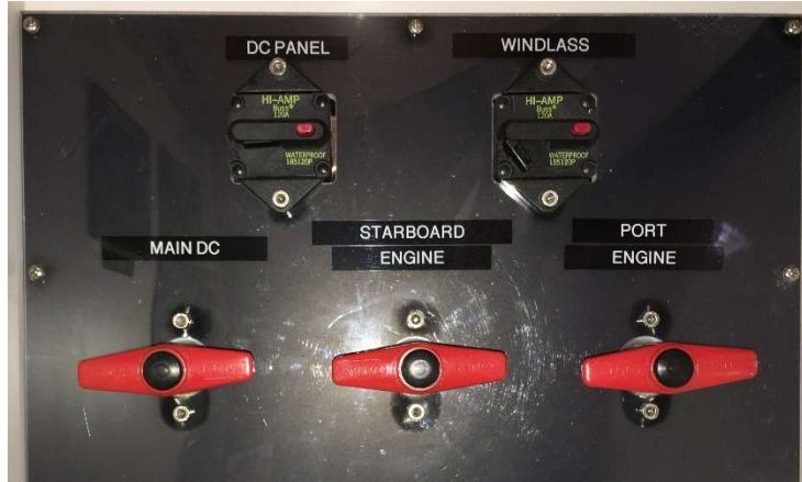
DC Battery Panel