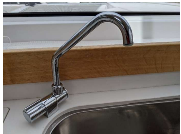
SEA WATER GALLEY FAUCET