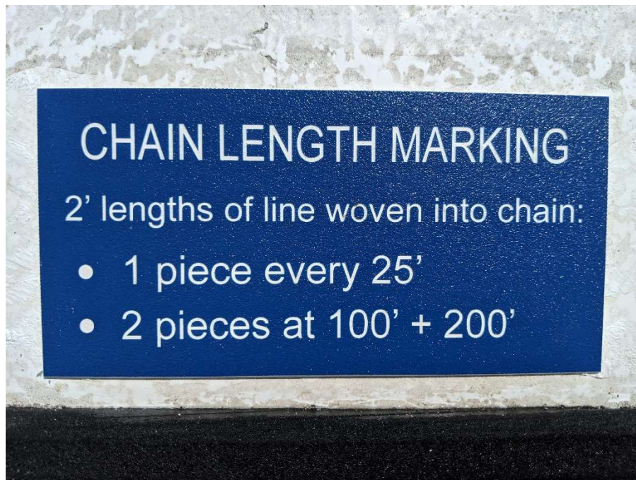
ANCHOR CHAIN PLACARD – ANCHOR LOCKER LID