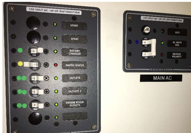
A/C Electrical Control Panel Main AC Panel