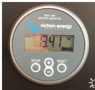
Victron Energy Monitor