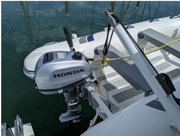
OUTBOARD STAYS ON DINGHY