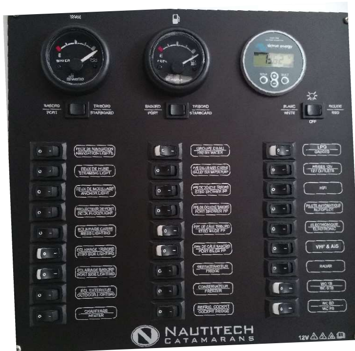
DC Electrical Panel