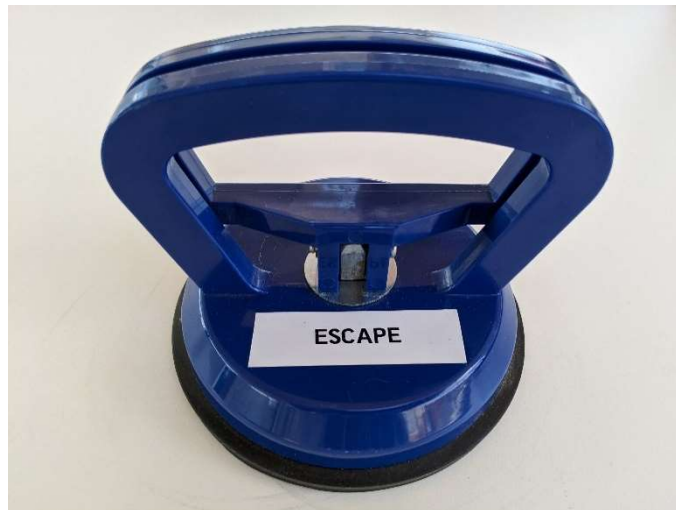
SUCTION TOOL FOR REMOVING FLOORBOARDS